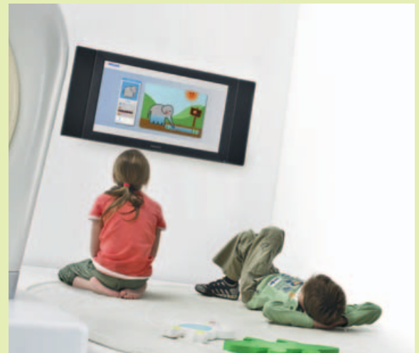
An animated story explains to children how a scanner works