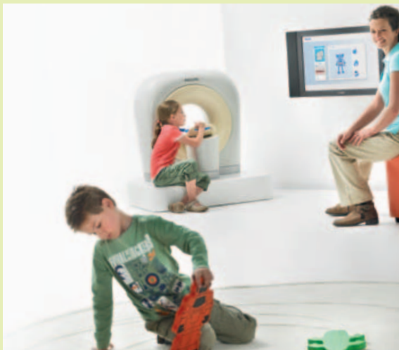
As children play with the KittenScanner, their attention is focused on having fun, so they are less likely to be worried about the upcoming procedure