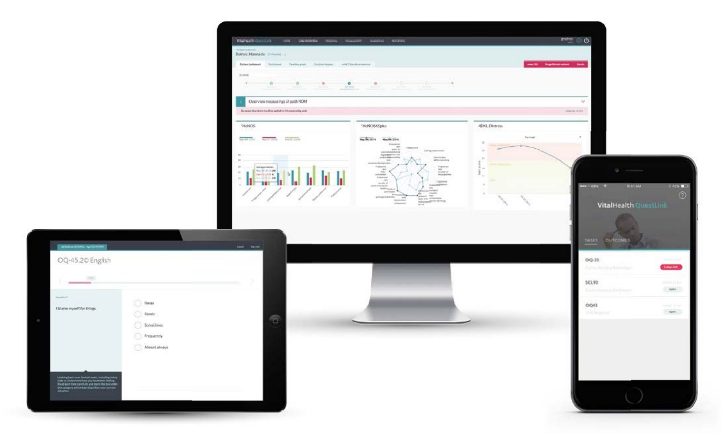
Figure 2: Configurable dashboards for physicians containing easy to interpret graphs.